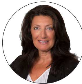
Owner's Project Manager