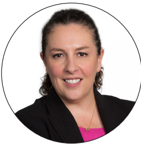
Owner's Project Manager

STV|DPM has brought together a multidiscipline industry team (Project Management, Construction, Commercial Real Estate Brokerage, Commissioning, Code Review, Design, Environmental Engineering, Technology & Furniture) to conduct a knowledge share of current industry best practices and due diligence around workplace design and construction requirements adapting to changes in codes and regulatory amendments in the post-COVID-19 world. We strongly believe innovative project strategies & checklists around these disciplines could assist our active clients and other Real Estate leaders in assessing new in office & remote work requirements as they bring their employees back to work and going forward. The ultimate goal is to develop a “Toolkit” of best practices resources that could be rolled out as part of ongoing & new project work.