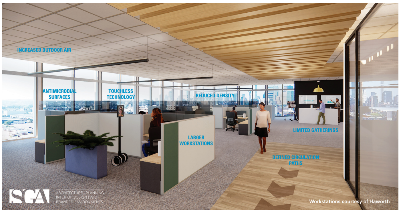
Rendering courtesy of SGA.