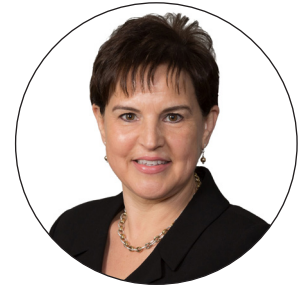
Owner's Project Manager